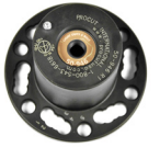
50-946 6 Lug Adapter