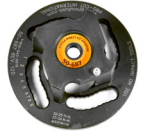
50-687 4 Lug Car Adapter