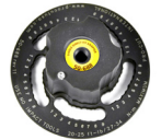
50-688 Smaller 5 Lug Car Adapter