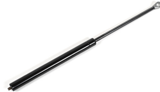
37-387 Short Shock