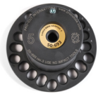
50-693 Larger 5 Lug Car Adapter