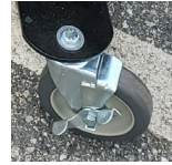
37-039 Locking wheels x2

Mobile Brake Service Package includes all standard X9D features plus: