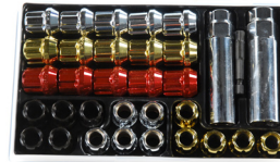
50-174 Speed Nut Kit