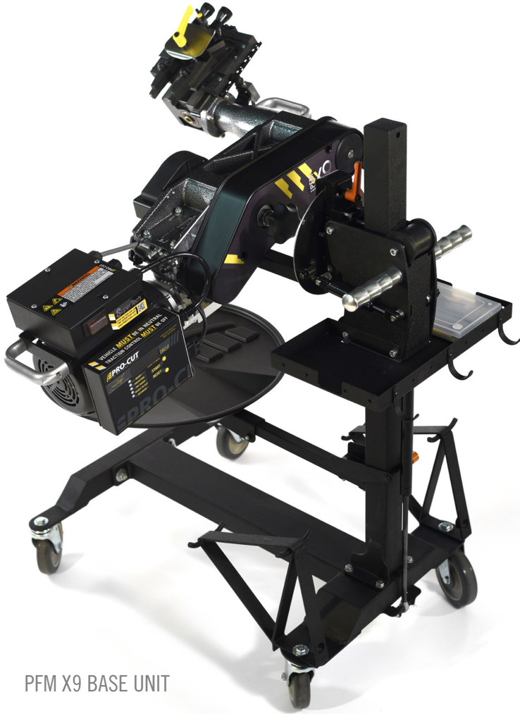
PFM X9 BASE UNIT