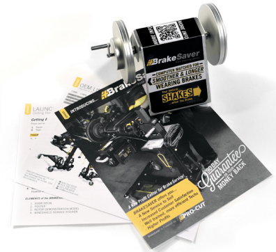
Free point of sale marketing program included!