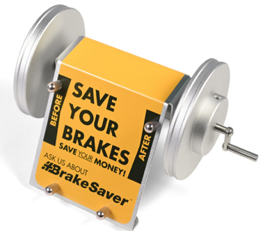
Free point of sale marketing program included!