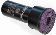
37-3990 Stud and hub cleaning abrasives combined in one easy to replace insert