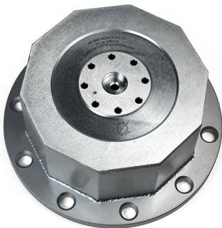
50-3989 10x335mm Pattern For larger transit and charter buses, some fire trucks, and other specialty heavy vehicles.