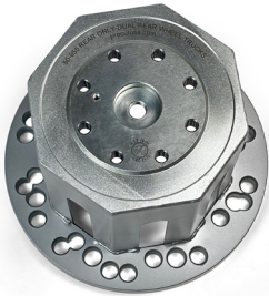
50-3955 1-Ton Dual Wheel Truck Adapter Fits Ford F450/550, GM 3500, RAM 4500/5500" Has the following patterns: 8 on 200mm, 8 on 210mm, 8 on 225mm and 10 on 225mm.