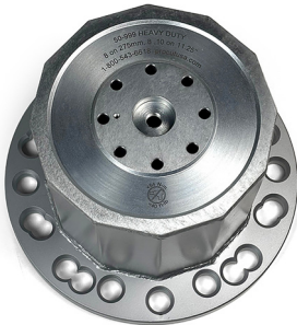
50-3999 8 x 275mm, and 10 x 11.25" Pattern For GM 4500/5500, Ford F650/750, Most school buses, and OTR tractors like Peterbilt, Kenworth, International etc, and trailers by most manufacturers.