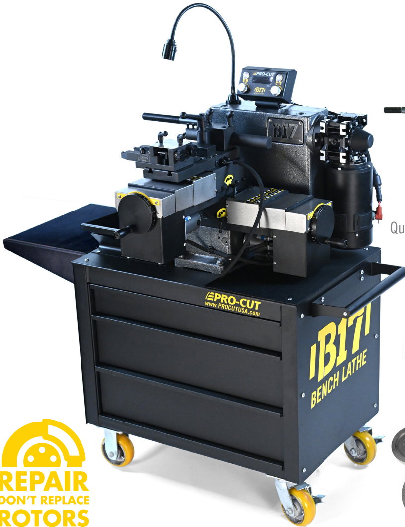
HD Mobile Tool Cabinet