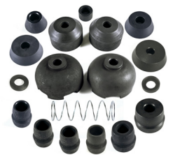
Standard Adapters Included