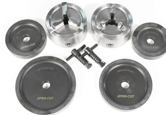
Optional Quick-Chuck Kit