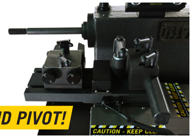
Quick-Pivot Cutting Head: Disc