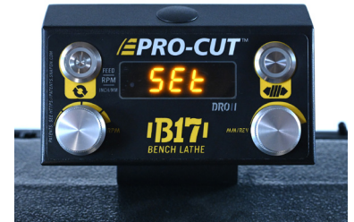
Advanced Electronics & Controls