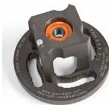
50-687 4 Lug Direct Fit Adapter