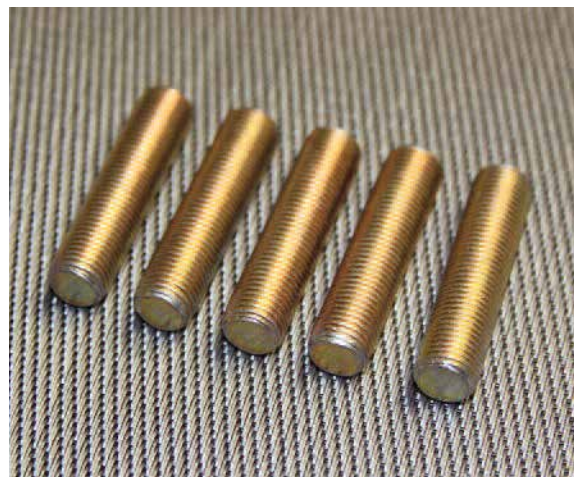
30-687 Set of Studs

Contact the Pro-Cut Service Department at 800.543.6618, Prompt #2, with any questions.