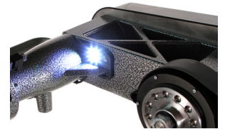
6 LED ON-BOARD WORK LIGHT & LIGHT- WEIGHT "X" BODY

BrakeSaver POS Marketing Kit Provides exceptional Return on Investment (ROI); 4-6 months is common in busier shops!