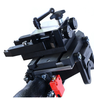
BALL DETENT DEPTH KNOBS