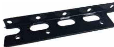
50-079 Shut-off Rail