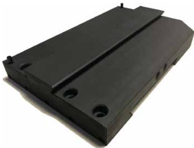
50-488 Slide Plate