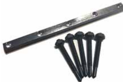
50-489 Gib Wedge