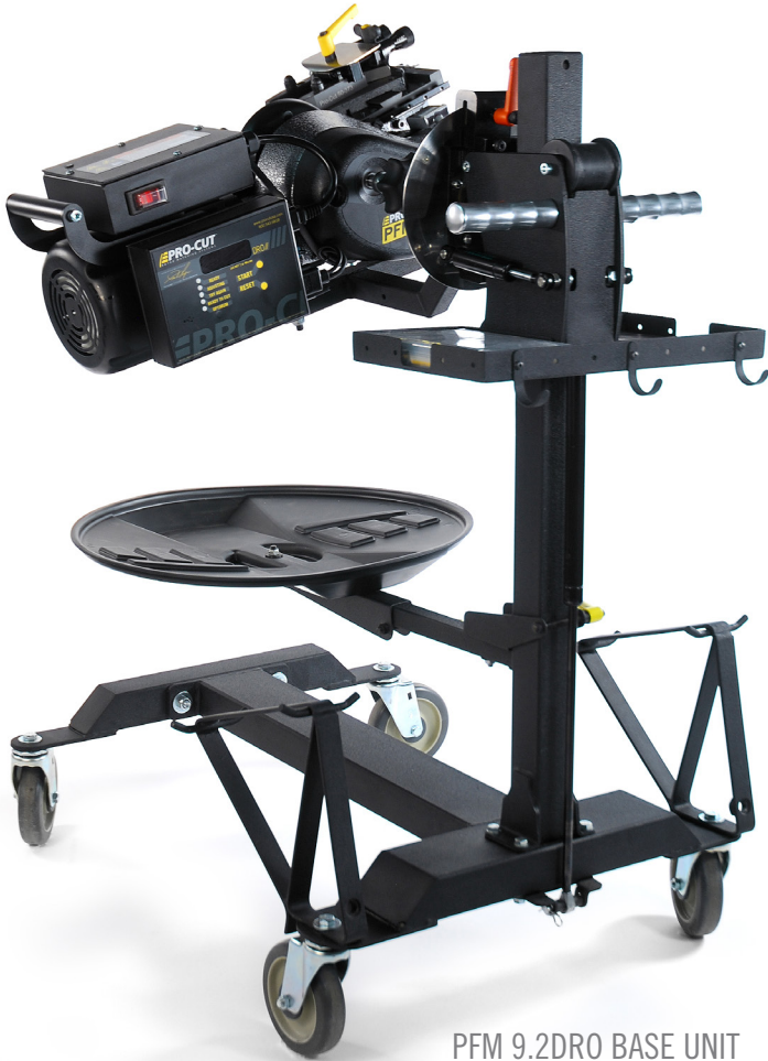
PFM 9.2DRO BASE UNIT