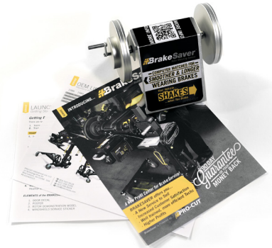
Free point of sale marketing program included!