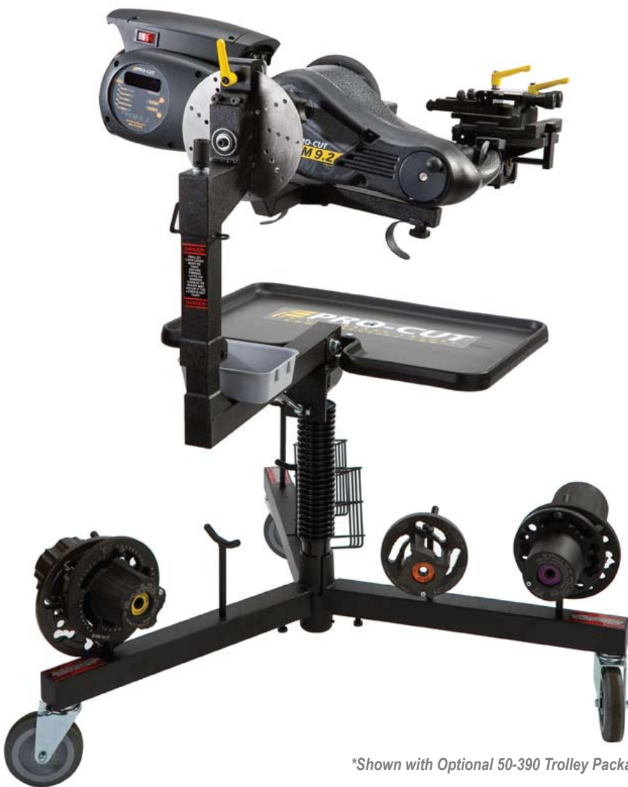
*Shown with Optional 50-390 Trolley Package

"We do a tremendous amount of brake work, and my technicians liked the first one so well that I had to purchase an additional one just to keep up with the demand. I would highly recommend this investment to any service facility; it will pay for itself in no time at all!"