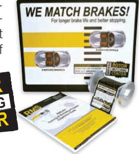
*Free point of sale marketing program included!

fix brakes, it's the profitable way. Pro-Cut offers a point of sale marketing and training program that will insure your lathe pays for itself many times over.