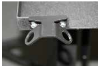
50-176 Holster The holster includes hardware to install on the edge of the trolley's tool tray, allowing the impact gun to be close to the user at all times.