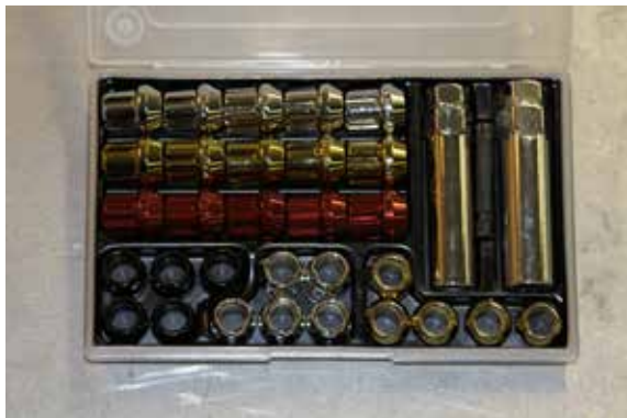
50-175 Speed Nut Kit* Each of the nuts has the size engraved on the side and the nuts are color coded for easy identification.