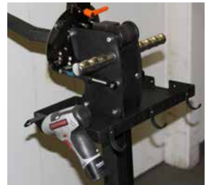
50-176 Holster on trolley**

Reduces process time over a minute and a half per brake job!